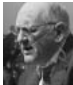
Praying for You,

There are many good places to train, and I pray YOU find the place for YOU. If Victory Baptist College can help meet your needs...that is why we are here! Preaching is our purpose!